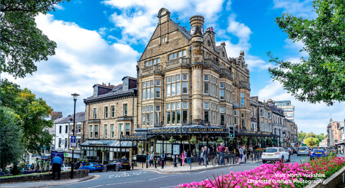
Visit North Yorkshire Charlotte Graham Photography