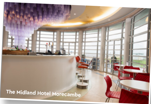
The Midland Hotel Morecambe

We very much look forward to welcoming you on one of our tours. So do phone our friendly sales team or pop in to see us, we are always happy to help.